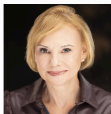
Hon. Sherri Goodman Secretary General, International Military Council on Climate & Security