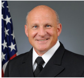
Admiral Michael Gilday U.S. Navy; 32nd Chief of Naval Operations