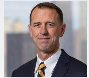
Admiral John Richardson U.S. Navy, Ret.; 31st Chief of Naval Operations