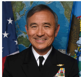
Admiral Harry Harris U.S. Navy, Ret; Fmr. Commander, USINDOPACOM