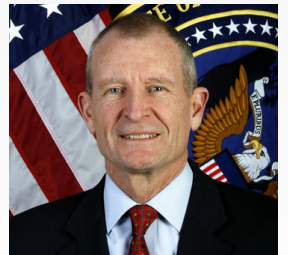
Admiral Dennis Blair U.S. Navy, Ret; Fmr. Director of National Intelligence