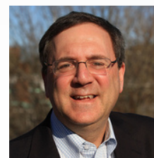
David Sanger White House and national security correspondent for The New York Times