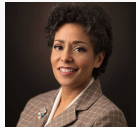
Admiral Michelle Howard U.S. Navy, Ret.; Fmr. Vice Chief of Naval Operations