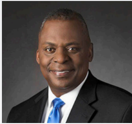
General Lloyd Austin U.S. Army, Ret.; 28th U.S. Secretary of Defense

Meet some of the leaders, experts, and dignitaries who have shared their expertise at the Global Security Forum