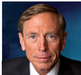
General David Petraeus U.S. Army, Ret.; Former Director of the CIA