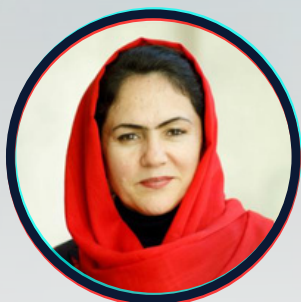
FAWZIA KOOFI Fmr Second Deputy Speaker, Afghan Parliament

A combat veteran, his early assignments included the First Armored Division, where he achieved Distinguished Leader honors, and with the Third Infantry Division, where he earned Top Engineer Company Commander distinction.