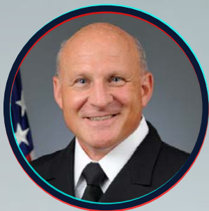
ADMIRAL MICHAEL GILDAY 32nd Chief of Naval Operations

Admiral Mike Gilday began serving as the 32nd Chief of Naval Operations on August 22, 2019.