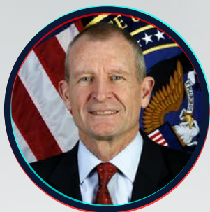
ADM. (U.S. NAVY, RET.) DENNIS C. BLAIR Fmr Director of National Intelligence; Fmr Commander in Chief, U.S. Pacific Command

As a flag officer, he served in joint positions as director of operations for NATO's Joint Force Command Lisbon; as chief of staff for Naval Striking and Support Forces NATO; director of operations, J3, for U.S. Cyber Command; and as director of operations, J3, for the Joint Staff. He recently served as director, Joint Staff.